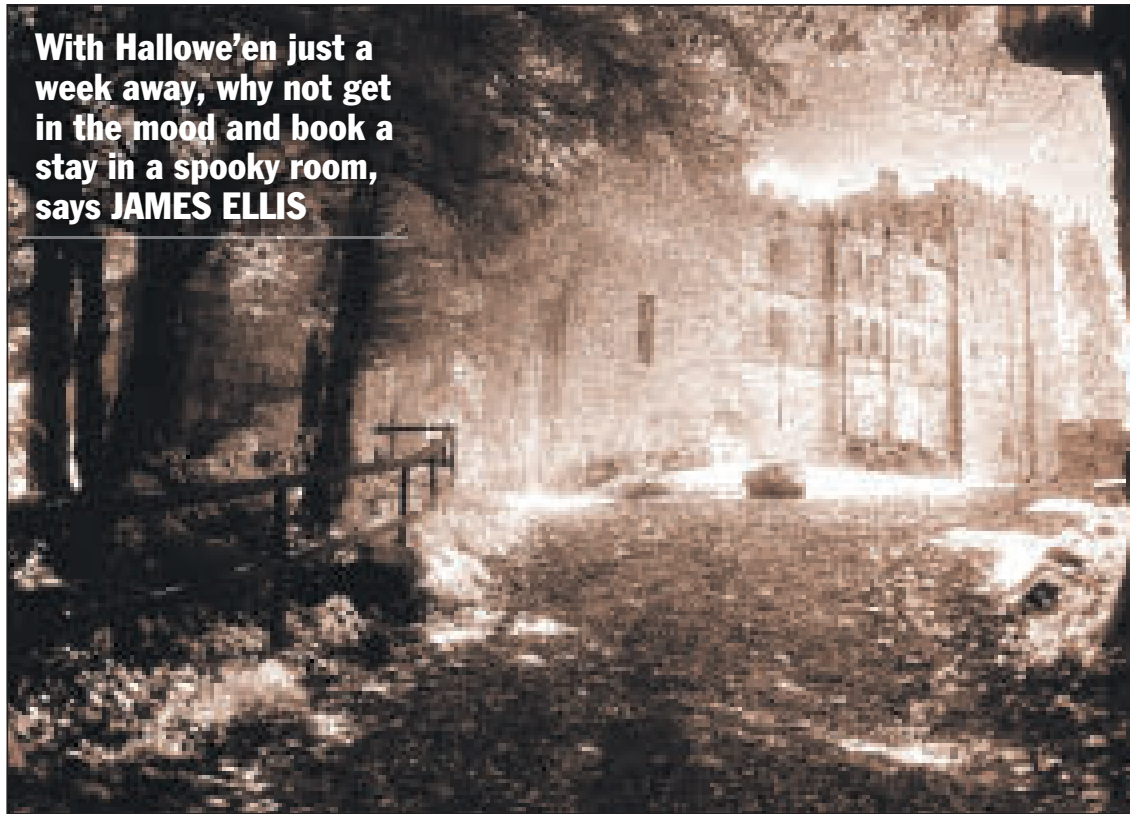
SPOOKY NIGHTS: 'Spine-chilling' Chillingham Castle, the 12th-century fortress in wild Northumberland where ghosts are reported to roam free

With Hallowe'en just a week away, why not get in the mood and book a stay in a spooky room, says JAMES ELLIS