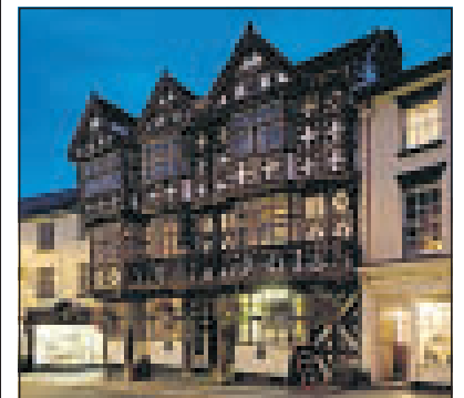
SPIRIT WORLD: Apparitions are common at The Feathers in Ludlow

● Eerie Evening stay from £198 (two sharing), B&B; includes themed events. Visit Shropshire: 01584 875053/shropshiretourism.co.uk